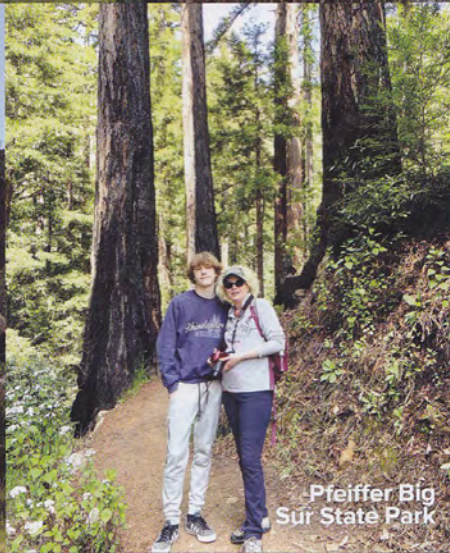
Pfeiffer Big Sur State Park