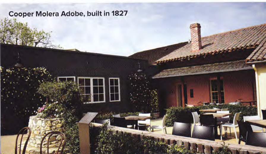
Cooper Molera Adobe, built in 1827